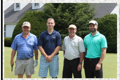
1st Place - Low Gross